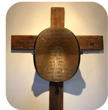
Lord's Prayer Cross, located in the Narthex.

The fruitfulness of our way hinges upon a commitment to a growing life of faith established upon the teachings of the Apostles as found in the Bible. While we have historic creeds that give us much light, Savoy Declaration (1658) for example, we require no creed but Christ. The Christian life, though, is not theoretical. Only when it is lived in the context of actual covenant fellowship can it be rooted and produce fruit. (John 17:19-23) Faith , Freedom , and Fellowship are our way. You are invited to join us on this pilgrimage of faith!