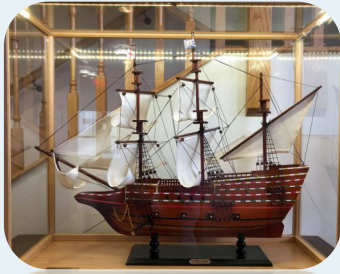
The Mayflower, located in the Narthex.